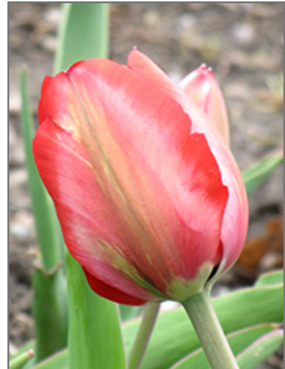
Menton Tulip flowers