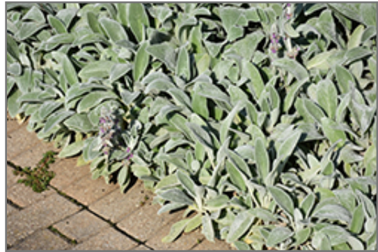
Lamb's Ears

Lamb's Ears is a fine choice for the garden, but it is also a good selection for planting in outdoor pots and containers. It can be used either as 'filler' or as a 'thriller' in the 'spiller-thriller-filler' container combination, depending on the height and form of the other plants used in the container planting. Note that when growing plants in outdoor containers and baskets, they may require more frequent waterings than they would in the yard or garden.