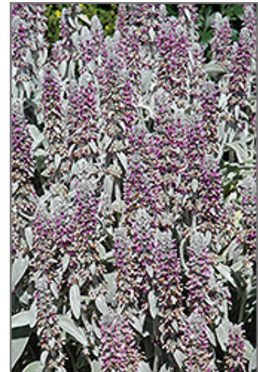
Lamb's Ears flowers