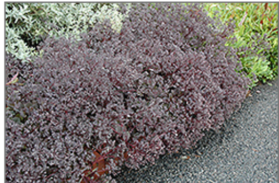
Bertram Anderson Stonecrop