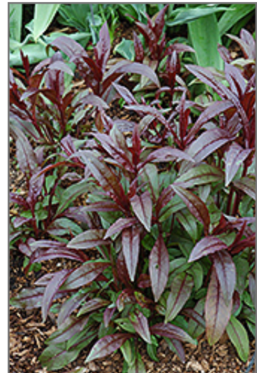
Husker Red Beard Tongue foliage