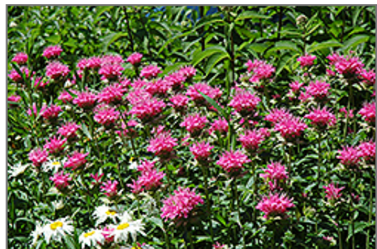
Marshall's Delight Beebalm flowers