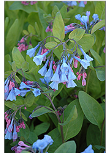
Virginia Bluebells flowers