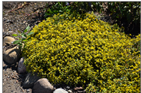
Rock 'N Low Yellow Brick Road Stonecrop in bloom