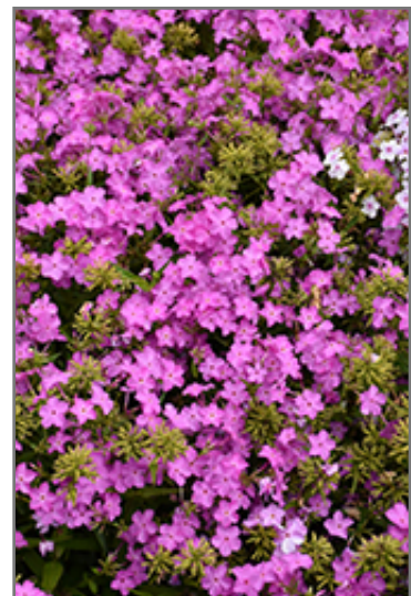
Opening Act Ultrapink Phlox flowers