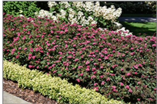
Double Play Doozie Spirea in bloom

Double Play Doozie Spirea is a multi-stemmed deciduous shrub with a more or less rounded form. Its relatively fine texture sets it apart from other landscape plants with less refined foliage.