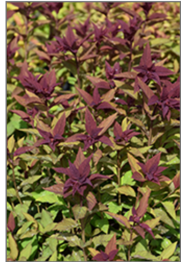
Double Play Doozie Spirea foliage

This shrub should only be grown in full sunlight. It prefers to grow in average to moist conditions, and shouldn't be allowed to dry out. It is not particular as to soil type or pH. It is highly tolerant of urban pollution and will even thrive in inner city environments. This particular variety is an interspecific hybrid.