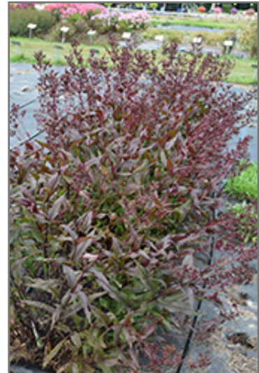
Pocahontas Beard Tongue

Pocahontas Beard Tongue is an herbaceous perennial with an upright spreading habit of growth. Its medium texture blends into the garden, but can always be balanced by a couple of finer or coarser plants for an effective composition.