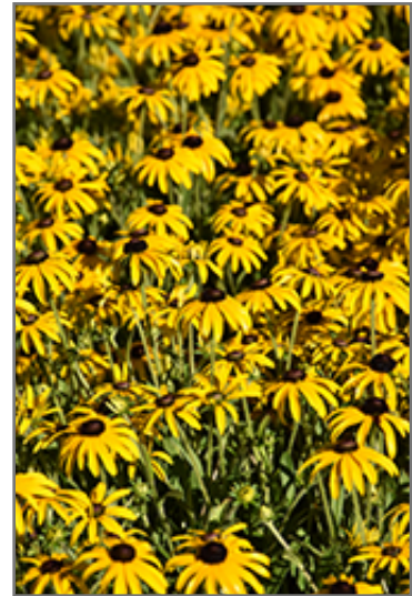
American Gold Rush Coneflower flowers

American Gold Rush Coneflower is a fine choice for the garden, but it is also a good selection for planting in outdoor pots and containers. With its upright habit of growth, it is best suited for use as a 'thriller' in the 'spiller-thriller-filler' container combination; plant it near the center of the pot, surrounded by smaller plants and those that spill over the edges. Note that when growing plants in outdoor containers and baskets, they may require more frequent waterings than they would in the yard or garden.