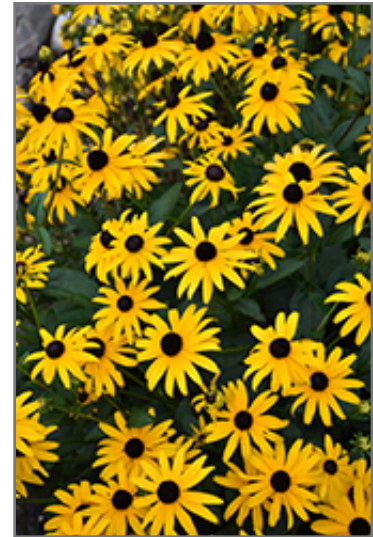
American Gold Rush Coneflower flowers

American Gold Rush Coneflower is an herbaceous perennial with an upright spreading habit of growth. Its medium texture blends into the garden, but can always be balanced by a couple of finer or coarser plants for an effective composition.