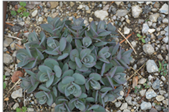
Rock 'N Grow Superstar Stonecrop