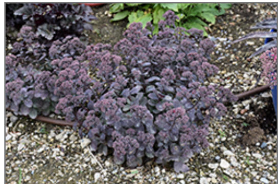
Rock 'N Grow Superstar Stonecrop in bloom