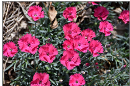
Paint The Town Magenta Pinks flowers