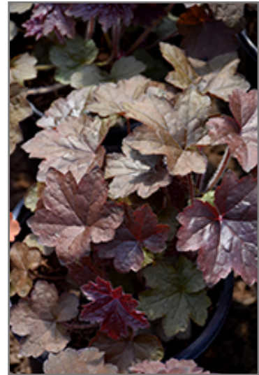
Palace Purple Coral Bells foliage

Palace Purple Coral Bells is recommended for the following landscape applications;