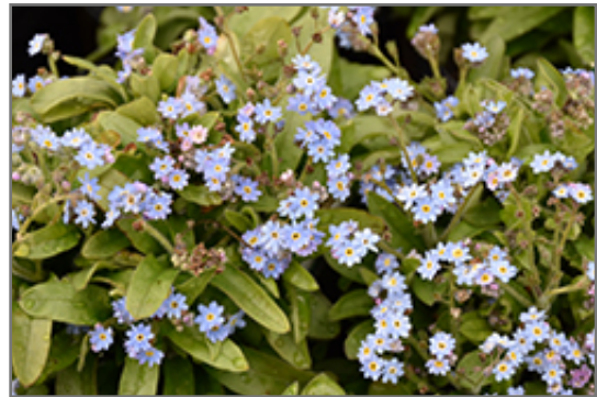
Victoria Blue Forget-Me-Not flowers