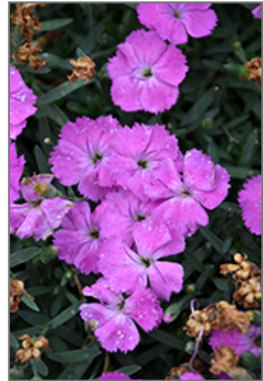
Paint The Town Fuchsia Pinks flowers

Paint The Town Fuchsia Pinks is an herbaceous evergreen perennial with a mounded form. It brings an extremely fine and delicate texture to the garden composition and should be used to full effect.