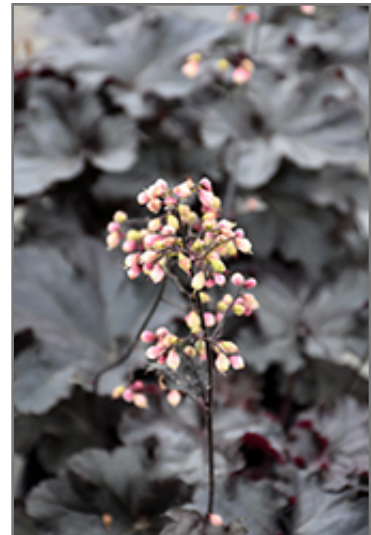
Black Pearl Coral Bells flowers