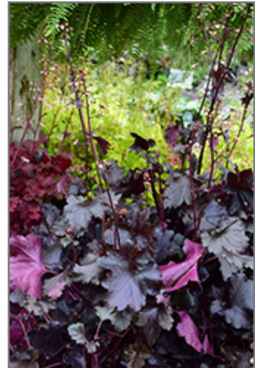
Black Pearl Coral Bells in bloom

This is a relatively low maintenance plant, and should be cut back in late fall in preparation for winter. It is a good choice for attracting hummingbirds to your yard. It has no significant negative characteristics.