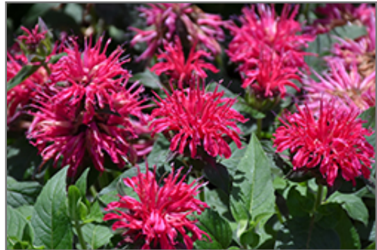
Balmy Rose Beebalm flowers

This plant will require occasional maintenance and upkeep, and should be cut back in late fall in preparation for winter. It is a good choice for attracting bees, butterflies and hummingbirds to your yard, but is not particularly attractive to deer who tend to leave it alone in favor of tastier treats. Gardeners should be aware of the following characteristic(s) that may warrant special consideration;