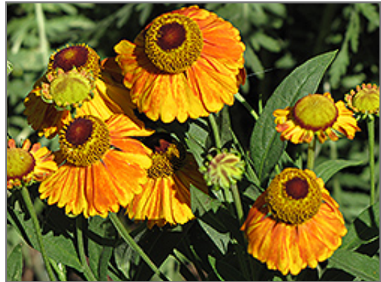
Mardi Gras Sneezweed flowers

Mardi Gras Sneezweed is an herbaceous perennial with an upright spreading habit of growth. Its medium texture blends into the garden, but can always be balanced by a couple of finer or coarser plants for an effective composition.