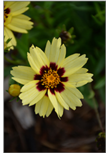
UpTick Cream and Red Tickseed flowers

This is a relatively low maintenance plant, and is best cleaned up in early spring before it resumes active growth for the season. It is a good choice for attracting bees and butterflies to your yard, but is not particularly attractive to deer who tend to leave it alone in favor of tastier treats. It has no significant negative characteristics.