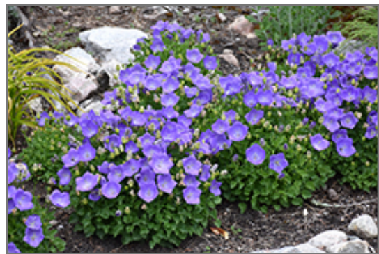
Rapido Blue Bellflower in bloom