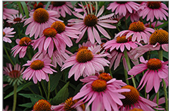
Magnus Coneflower flowers

Magnus Coneflower is an herbaceous perennial with an upright spreading habit of growth. Its medium texture blends into the garden, but can always be balanced by a couple of finer or coarser plants for an effective composition.