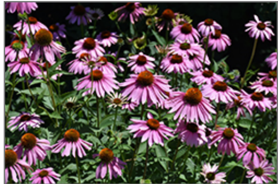
Magnus Coneflower flowers

Magnus Coneflower is a fine choice for the garden, but it is also a good selection for planting in outdoor pots and containers. With its upright habit of growth, it is best suited for use as a 'thriller' in the 'spiller-thriller-filler' container combination; plant it near the center of the pot, surrounded by smaller plants and those that spill over the edges. It is even sizeable enough that it can be grown alone in a suitable container. Note that when growing plants in outdoor containers and baskets, they may require more frequent waterings than they would in the yard or garden.