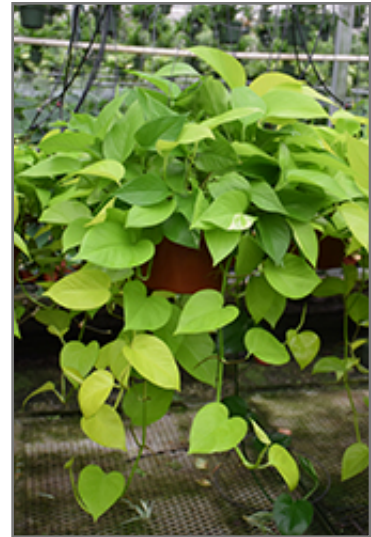
Neon Pothos in full

This is an herbaceous evergreen houseplant with a spreading, ground-hugging habit of growth. This plant can be pruned at any time to keep it looking its best.