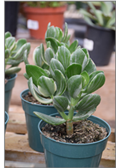
Variegated Jade Plant in full

This is a multi-stemmed evergreen houseplant with an upright spreading habit of growth. This plant can be pruned at any time to keep it looking its best.