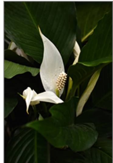
Peace Lily flowers