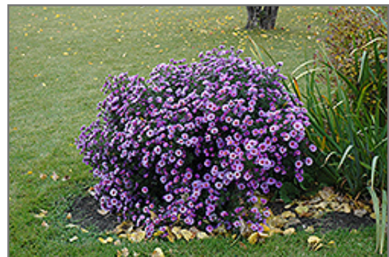
Purple Dome Aster in bloom