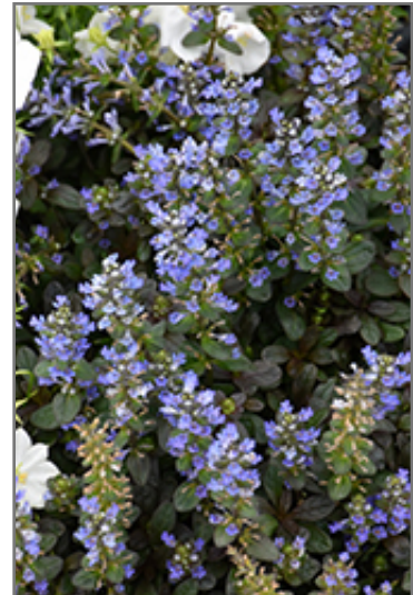
Chocolate Chip Bugleweed flowers