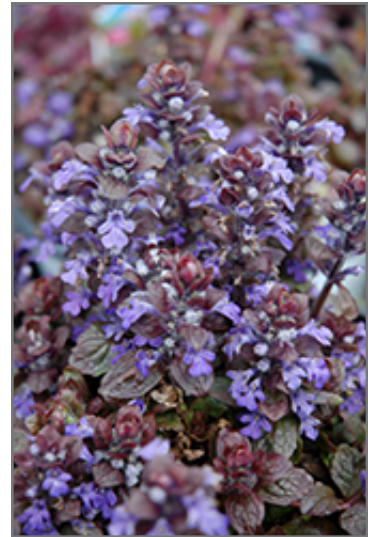
Bronze Beauty Bugleweed flowers