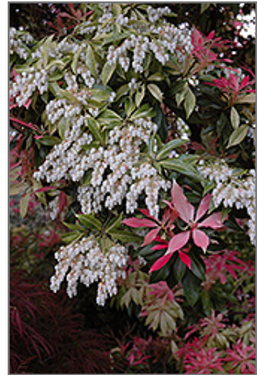
Valley Fire Japanese Pieris flowers

Valley Fire Japanese Pieris is recommended for the following landscape applications;