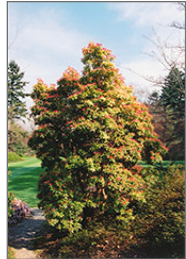
Valley Fire Japanese Pieris

This shrub does best in full sun to partial shade. It requires an evenly moist well-drained soil for optimal growth, but will die in standing water. It is very fussy about its soil conditions and must have rich, acidic soils to ensure success, and is subject to chlorosis (yellowing) of the foliage in alkaline soils. It is somewhat tolerant of urban pollution, and will benefit from being planted in a relatively sheltered location. Consider applying a thick mulch around the root zone in winter to protect it in exposed locations or colder microclimates. This is a selected variety of a species not originally from North America, and parts of it are known to be toxic to humans and animals, so care should be exercised in planting it around children and pets.