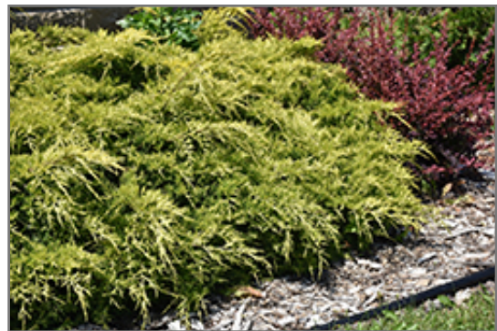
Gold Lace Juniper

This is a relatively low maintenance shrub, and is best pruned in late winter once the threat of extreme cold has passed. Deer don't particularly care for this plant and will usually leave it alone in favor of tastier treats. It has no significant negative characteristics.