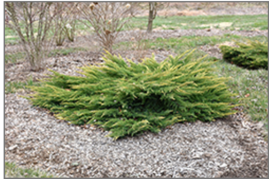
Gold Lace Juniper

Gold Lace Juniper will grow to be about 24 inches tall at maturity, with a spread of 5 feet. It tends to fill out right to the ground and therefore doesn't necessarily require facer plants in front. It grows at a slow rate, and under ideal conditions can be expected to live for approximately 30 years.