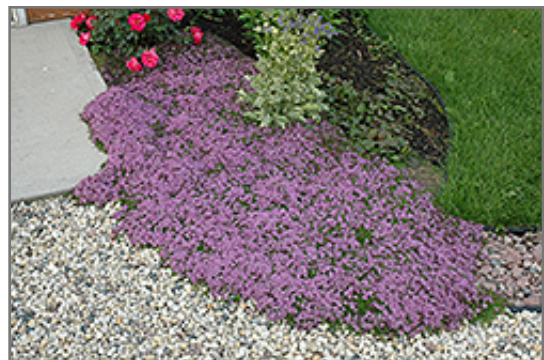
Red Creeping Thyme in bloom