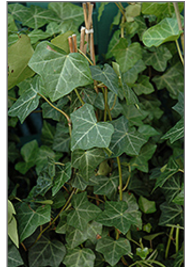
Thorndale Ivy foliage

Thorndale Ivy is recommended for the following landscape applications;