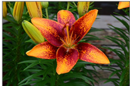
Lily Looks Tiny Orange Sensation Lily flowers