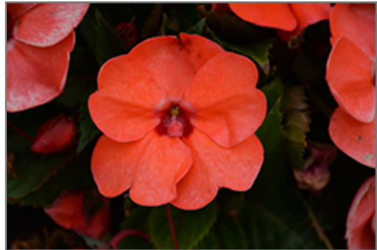
SunPatiens Compact Hot Coral New Guinea Impatiens flowers

SunPatiens Compact Hot Coral New Guinea Impatiens is a dense herbaceous annual with a mounded form. Its medium texture blends into the garden, but can always be balanced by a couple of finer or coarser plants for an effective composition.