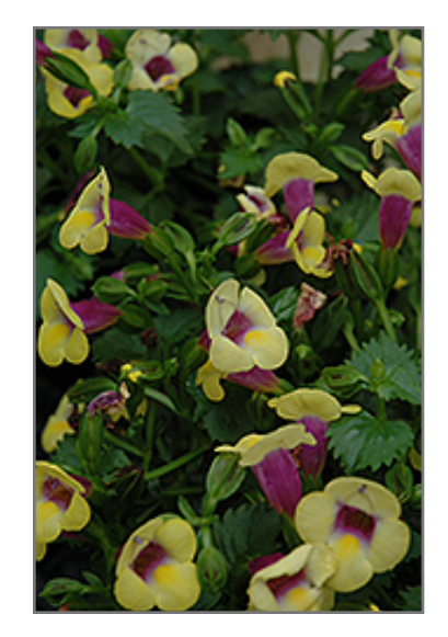
Yellow Moon Torenia flowers

Yellow Moon Torenia is an herbaceous annual with a trailing habit of growth, eventually spilling over the edges of hanging baskets and containers. Its relatively fine texture sets it apart from other garden plants with less refined foliage.