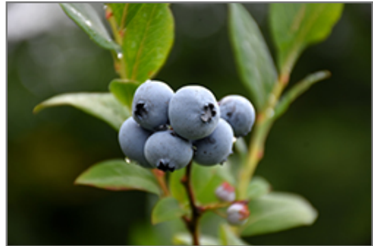
Northsky Blueberry fruit