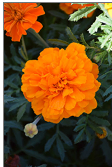
Safari Tangerine Marigold flowers