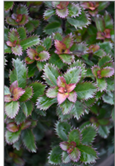
Scallywag Holly foliage