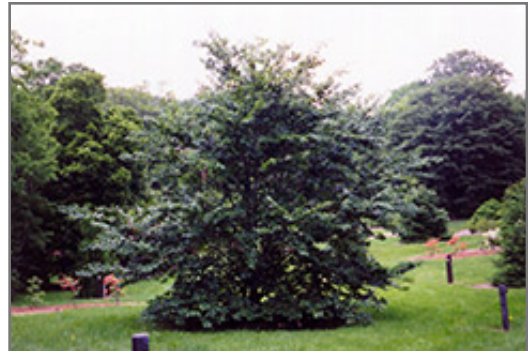
American Beech