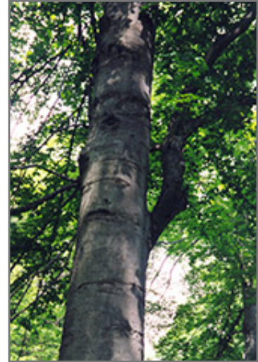
American Beech bark

This tree should only be grown in full sunlight. It requires an evenly moist well-drained soil for optimal growth, but will die in standing water. It is not particular as to soil pH, but grows best in rich soils. It is quite intolerant of urban pollution, therefore inner city or urban streetside plantings are best avoided, and will benefit from being planted in a relatively sheltered location. This species is native to parts of North America.