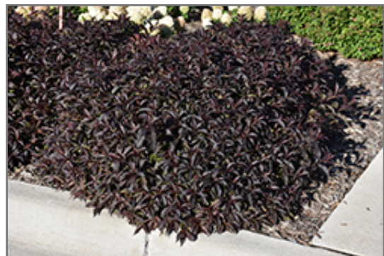
Spilled Wine Weigela