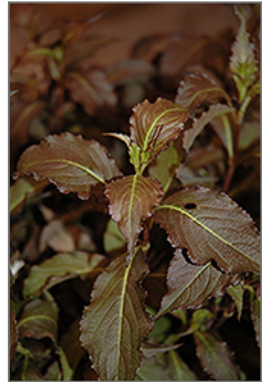
Spilled Wine Weigela foliage

Spilled Wine Weigela makes a fine choice for the outdoor landscape, but it is also well-suited for use in outdoor pots and containers. Because of its height, it is often used as a 'thriller' in the 'spiller-thriller-filler' container combination; plant it near the center of the pot, surrounded by smaller plants and those that spill over the edges. It is even sizeable enough that it can be grown alone in a suitable container. Note that when grown in a container, it may not perform exactly as indicated on the tag - this is to be expected. Also note that when growing plants in outdoor containers and baskets, they may require more frequent waterings than they would in the yard or garden.