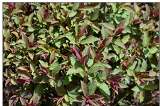
Double Play Artisan Spirea foliage