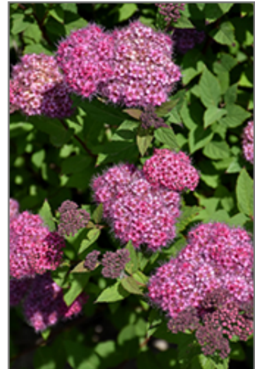
Double Play Artisan Spirea flowers

This shrub will require occasional maintenance and upkeep, and is best pruned in late winter once the threat of extreme cold has passed. It is a good choice for attracting butterflies to your yard, but is not particularly attractive to deer who tend to leave it alone in favor of tastier treats. It has no significant negative characteristics.