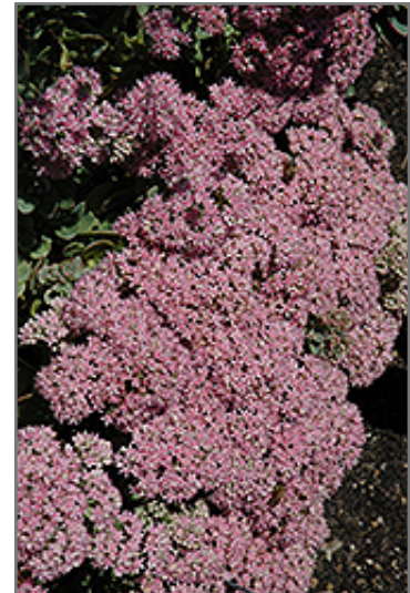
Lime Zinger Stonecrop flowers

Lime Zinger Stonecrop is a dense herbaceous perennial with a ground-hugging habit of growth. Its medium texture blends into the garden, but can always be balanced by a couple of finer or coarser plants for an effective composition.