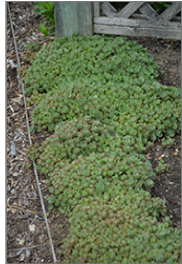
Lime Zinger Stonecrop

Lime Zinger Stonecrop is a fine choice for the garden, but it is also a good selection for planting in outdoor pots and containers. Because of its spreading habit of growth, it is ideally suited for use as a 'spiller' in the 'spiller-thriller-filler' container combination; plant it near the edges where it can spill gracefully over the pot. Note that when growing plants in outdoor containers and baskets, they may require more frequent waterings than they would in the yard or garden.