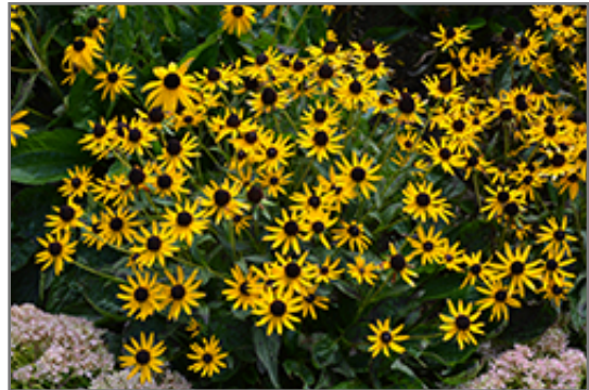
Little Goldstar Coneflower in bloom

Little Goldstar Coneflower is an herbaceous perennial with an upright spreading habit of growth. Its medium texture blends into the garden, but can always be balanced by a couple of finer or coarser plants for an effective composition.