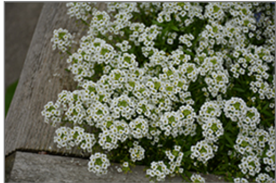
Snow Princess Alyssum flowers

Snow Princess Alyssum is recommended for the following landscape applications;