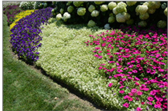
Frosty Knight Alyssum in bloom

Frosty Knight Alyssum is a fine choice for the garden, but it is also a good selection for planting in hanging baskets. Because of its trailing habit of growth, it is ideally suited for use as a 'spiller' in the 'spiller-thriller-filler' container combination; plant it near the edges where it can spill gracefully over the pot. Note that when growing plants in outdoor containers and baskets, they may require more frequent waterings than they would in the yard or garden.