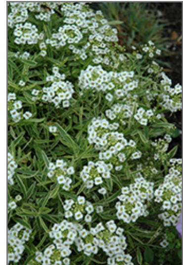
Frosty Knight Alyssum flowers

This plant will require occasional maintenance and upkeep, and should not require much pruning, except when necessary, such as to remove dieback. It is a good choice for attracting bees and butterflies to your yard, but is not particularly attractive to deer who tend to leave it alone in favor of tastier treats. It has no significant negative characteristics.