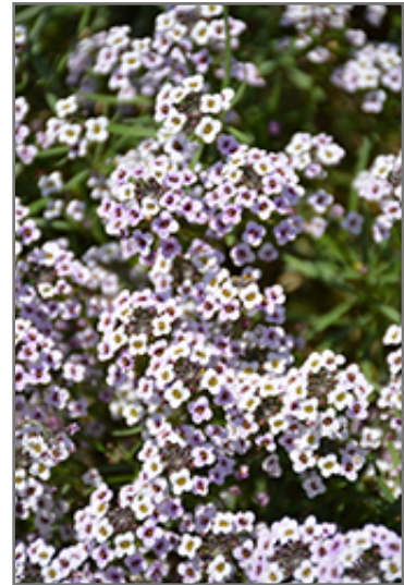
Blushing Princess Sweet Alyssum flowers

Blushing Princess Sweet Alyssum is a dense herbaceous annual with a trailing habit of growth, eventually spilling over the edges of hanging baskets and containers. It brings an extremely fine and delicate texture to the garden composition and should be used to full effect.