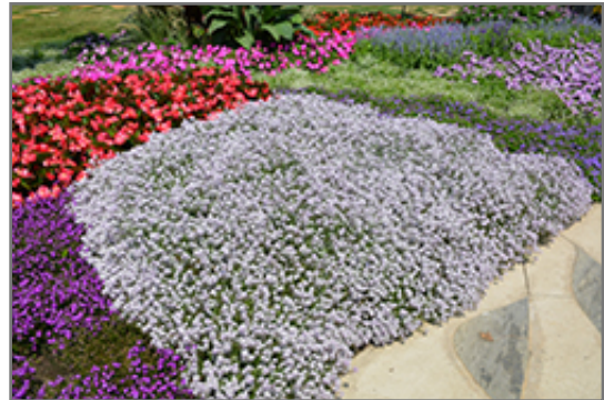
Blushing Princess Sweet Alyssum in bloom