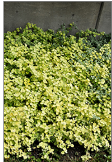
Lemon Licorice Plant