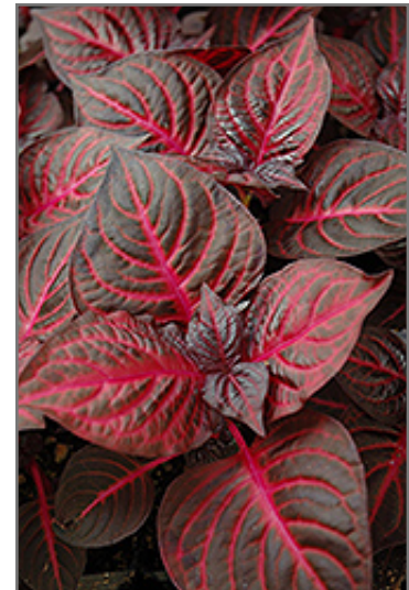
Blazin' Rose Blood Leaf foliage