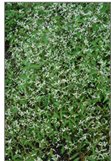
Breathless White Euphorbia flowers