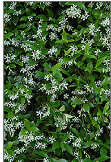
Confederate Star-Jasmine flowers